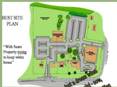
"With Sears Property trying to keep white house"

This "Best Site" was just a dream when we launched Vision: No Restraint - now, because of the Sears Purchase, it is the Plan that approved last week to go to County!